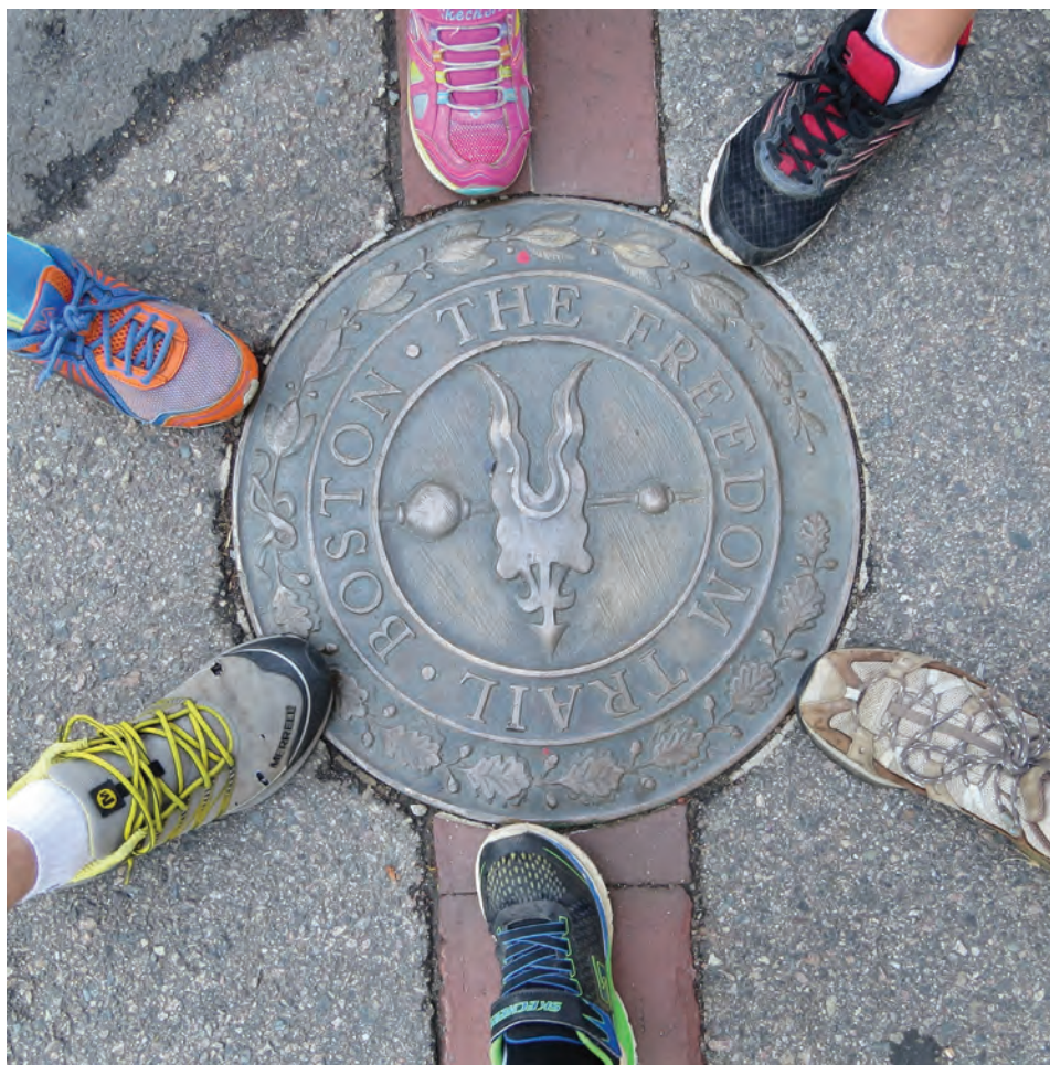
Homeschoolers Exploring Boston, 2016