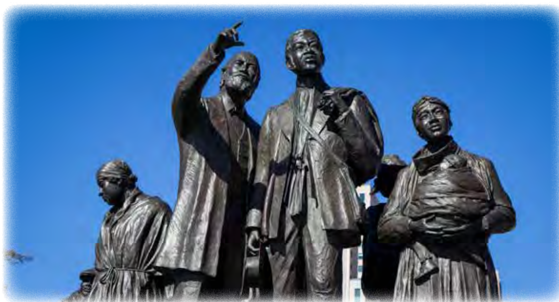
Gateway to Freedom International Memorial to the Underground Railroad, Detroit, Michigan