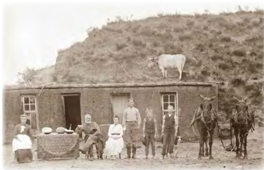
Sod House in Custer County, Nebraska, 1886