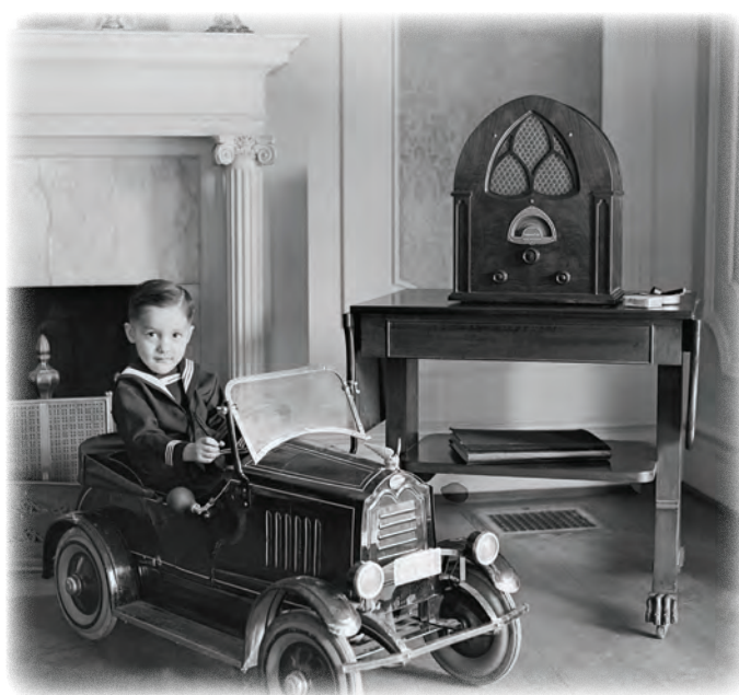
Boy with Toy Car and Radio, c. 1932