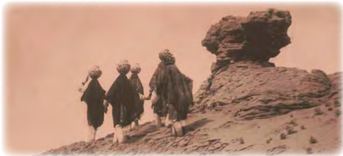
Acoma girls collecting water, New Mexico