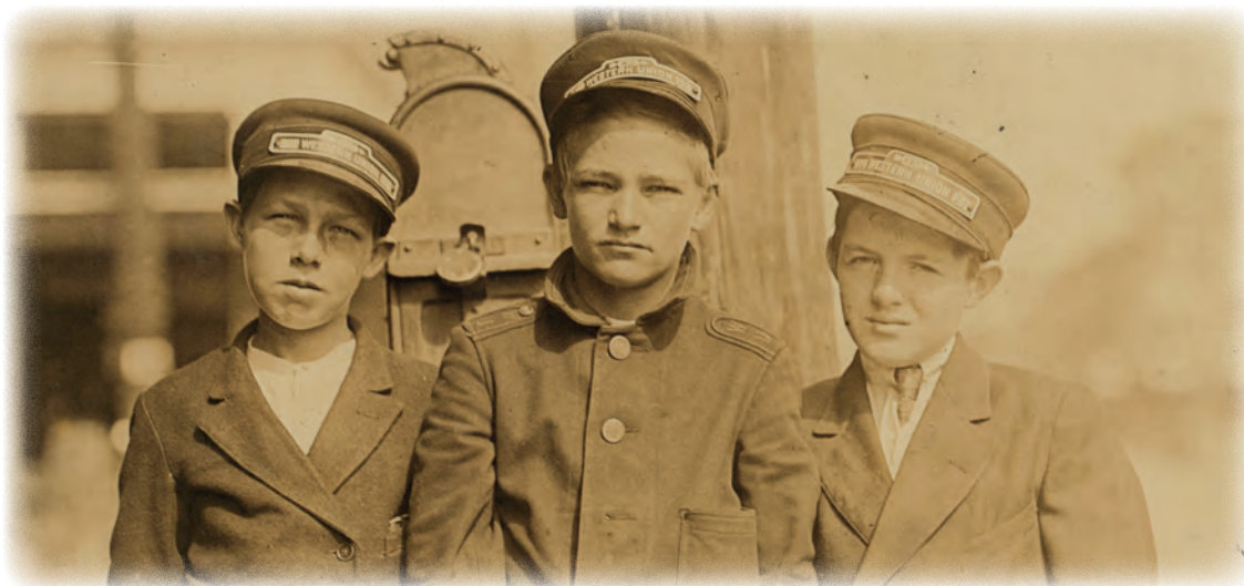
Messenger Boys in Jacksonville, Florida, 1913